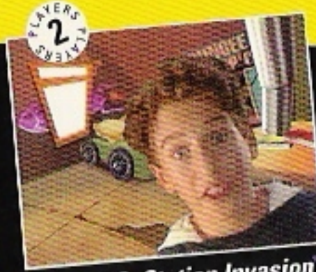
Club 3DO: Station Invasion™

Eleven Hot Titles! This Shouldn't Hurt...Much.